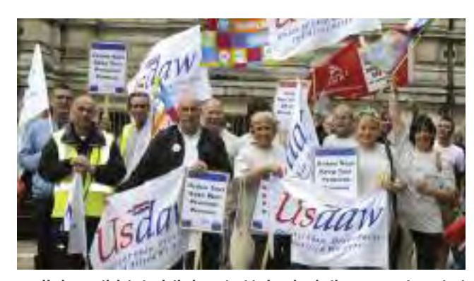
Usdaw activists took their protest to London in the summer to protest against planned changes to the Unilever pension scheme

The company's proposals were overwhelminaly rejected by members across the UK with only 22 voting in favour and 1,459 against. Workers will now vote on whether to go on strike over the coming months. Members of Unite and GMB are also involved.