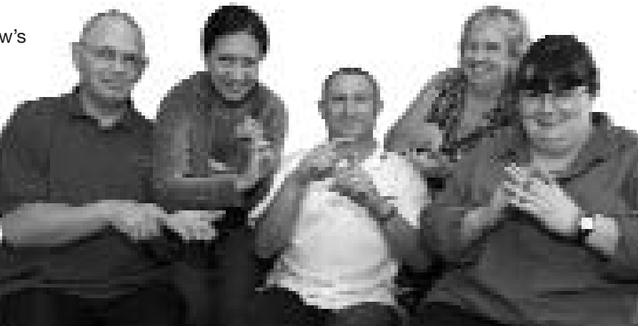
Members signing the word 'Usdaw' using British Sign Language

They want access to a broad range of learning – for example British Sign Language, European Languages, Plumbing, Football Coaching, Digital Photography as well as NVQs, Skills for Life/Basic Skills and IT courses.