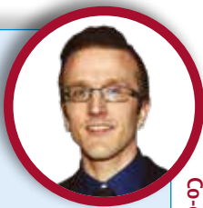
Co-op Reps Bristol, 2017 Winners