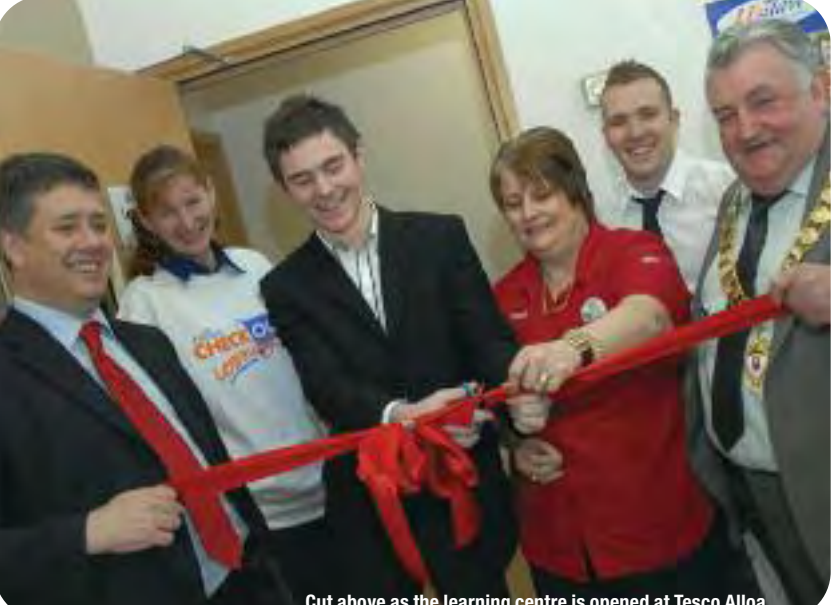
Cut above as the learning centre is opened at Tesco Alloa

"We also have a library in the canteen and staff can brush up their skills and use the computers in their own time to surf the net, print their photos, book holidays and shop online."